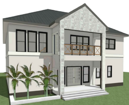
Artist rendering of the future Boy's Home of Mt Pleasant, Inc. Jamaica